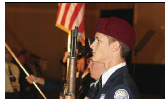
Members of the Durango High School Air Force Junior ROTC color guard remain at attention.