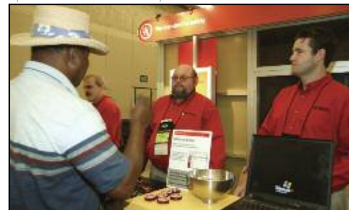
Underwriters' Laboratory representatives answered questions about their listing process.