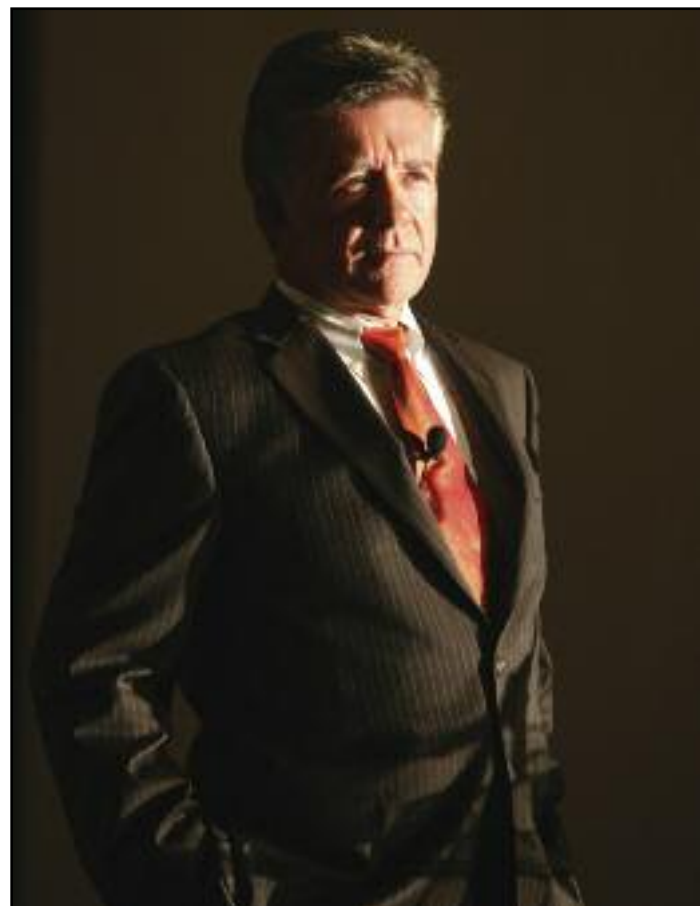
Thicke, a seasoned actor and comedian, entertained the crowd with a humorous and inspirational keynote address.