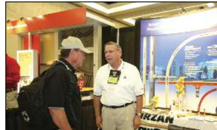
This year's expo was filled with informative presentations and highly interested visitors.