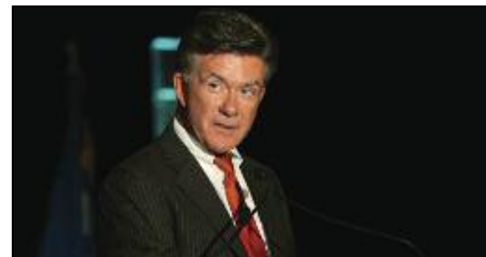
With his signature wry humor and comedic timing, keynote speaker Alan Thicke kept the crowd laughing for nearly an hour as he shared many personal stories, from growing up in rural Canada to life in Hollywood.