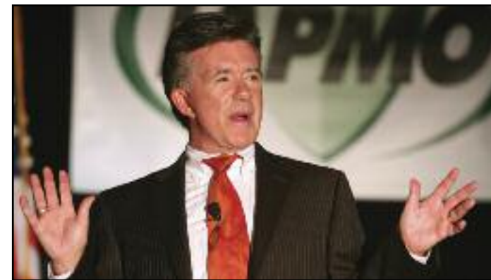
Father of R&B music star Robin Thicke, Alan expressed how proud is to be able to take a back seat to his son's successful music career.