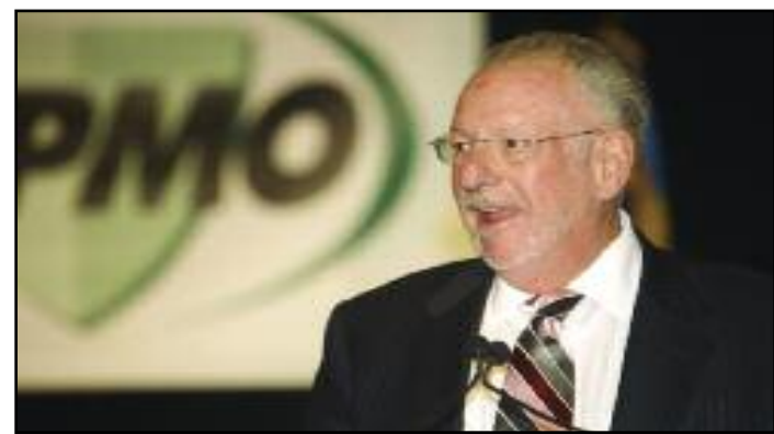
Mayor Oscar Goodman welcomes IAPMO to the city of Las Vegas before entertaining the assembly with humorous anecdotes.